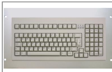
DS102W 19 Zoll-6HE